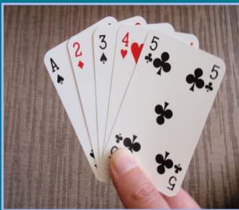
TABLE GAMES CLUB

The Centre's new professional AV equipment means we are all geared up to show films. Please get in touch if you would support a Film Club for regular screenings of your favourites.